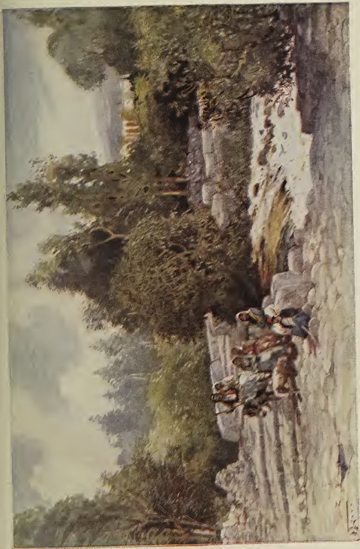
The Approach to Baniyas.